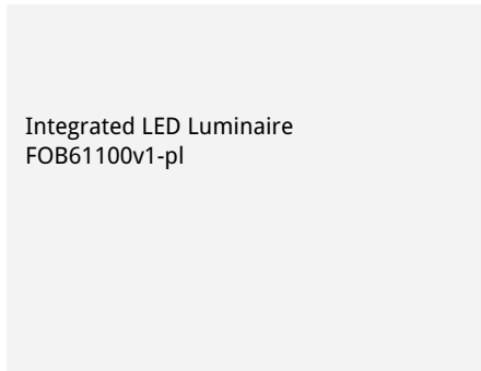
Integrated LED Luminaire FOB61100v1-pl